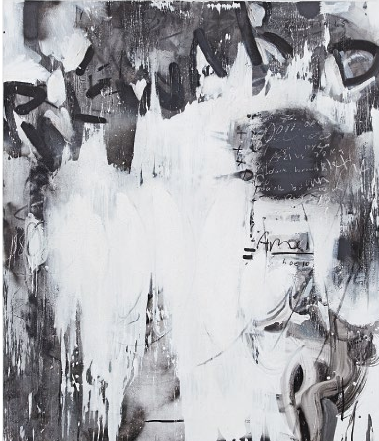
Two views of Top Ten: Robert $80,000,000.XX, 2016, a 72 x 60 in. painting. On the right, research materials are collected on the canvas back.