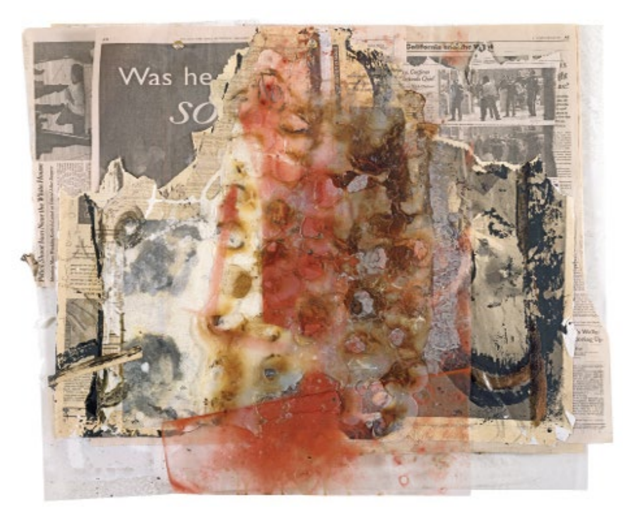
Shot in DC, 1995. Acrylex, clay, polyester sheet, and newspaper, 22 x 27 in