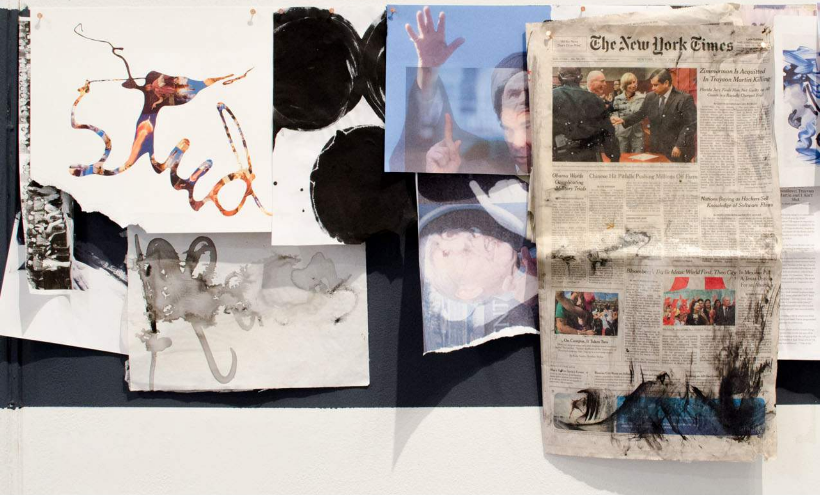
Furtive Gesture (detail), 2013, mixed-medium drawings, prints and photographs on various papers, dimensions variable.

numerologists like Alfred Jensen; a kinship can also be seen with Charles Demuth's ecstatic dream of the figure five in gold. Still, McClelland's turbulent compositions undeniably couple oddly with number problems. On the other hand, they make a comfortable transitive equation to math through the metric beat of music, which has propelled a great deal of her work. She has often cited musicians in her paintings' titles and painted words, and honored them in her brushwork's driving rhythm—a force she considers fundamental to all forms of expression. As McClelland puts it, the link between rhythm and the irrepressible human desire for connection is so strong you can see it in babies throwing a ball back and forth, communicating without a single word.