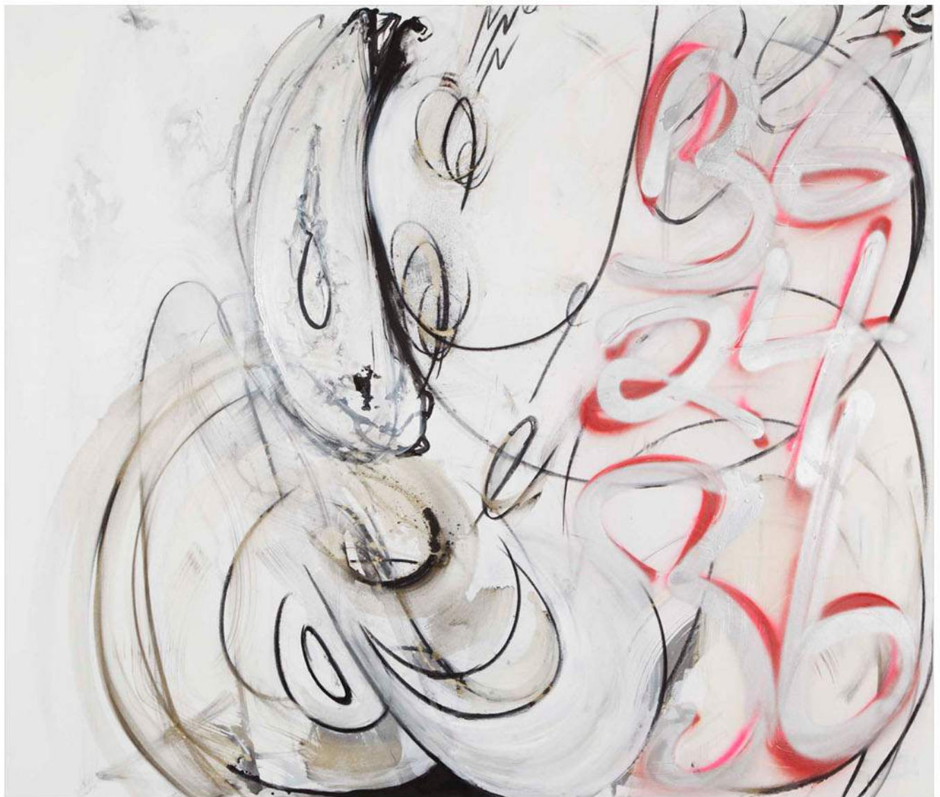
Previous spread, Phil "The Gift" and Jay "Cuts" ( Ideal Proportions ), 2013, dry pigment, gesso, polymer and oil paint on portrait linen, diptych, 84 by 145 inches overall.

by McClelland, who acknowledges that the "Ideal Proportions" series constitutes a form of figure drawing, with "figure" meant to be read at least two ways. 1 She points out, too, that in bodybuilding competitions—which involve flexing limbs and striking poses, not lifting weights—contestants are judged by their graceful transitions from one position to the next, and, notably, by their muscles' definition and form, the latter criteria also applicable to traditional figure painting (which McClelland studied as an undergraduate, at the University of Michigan).