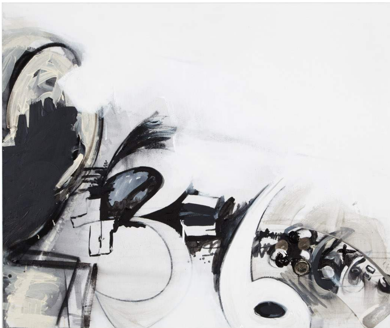
Solutions for Polke (6 + 6 = 5), 2013, dry pigment, gesso, polymer and oil paint on portrait linen, 40 by 48 inches.

graphs are understood to represent lies, gets interestingly complicated when math is telling the story. Is it possible to create compelling fiction with numbers? Just how uninhibited by logic are the irrational ones? Are numbers more abstract than letters or more embodied, arising as they do from a language first counted out on fingers?