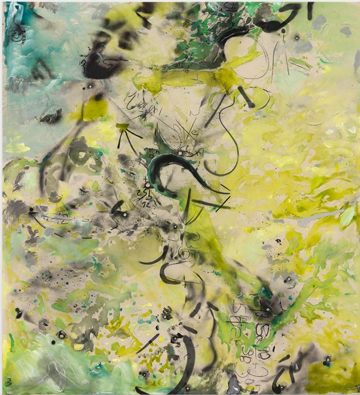
Formula No. 3 in Green with Strontium and Xenon, 2019, mixed media on canvas, 82 x 72 in. (208 x 183 cm.)