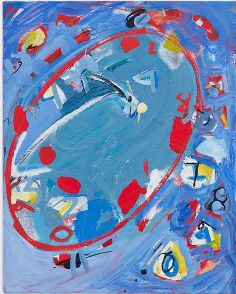
O' Clock in Blue , 2018-2020, oil on linen, 20 x 16 in. (51 x 41 cm.)