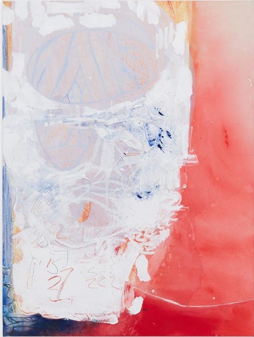
Healing Code for Courage , 2020, polymer on canvas, 40 x 30 in. (102 x 76 cm.)