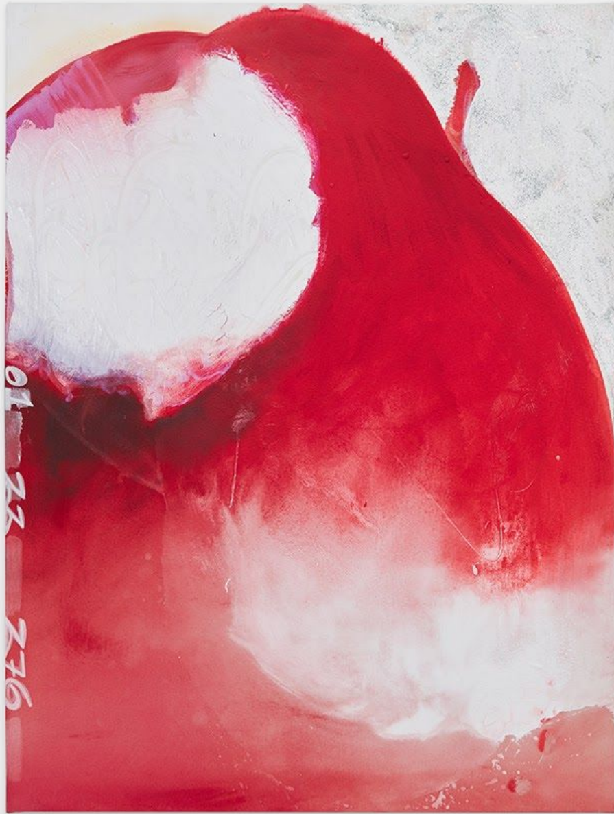
Healing Code to Make Love New Again, 2020, polymer on canvas, 40 x 30 in. (102 x 76 cm.)