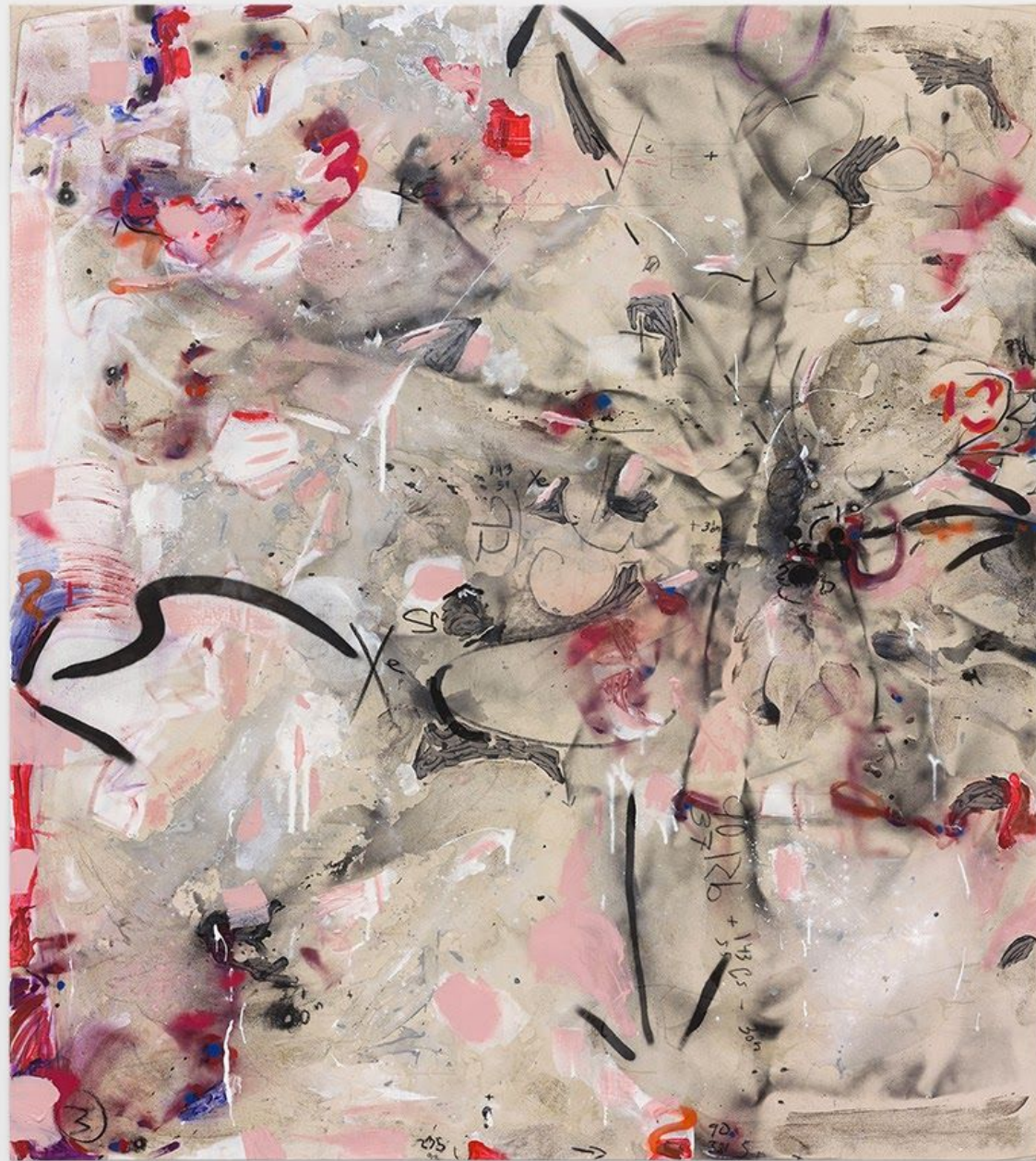
Formula No. 3 in Red with Strontium and Xenon , 2019, mixed media on canvas, 85 x 75 in. (216 x 191 cm.)