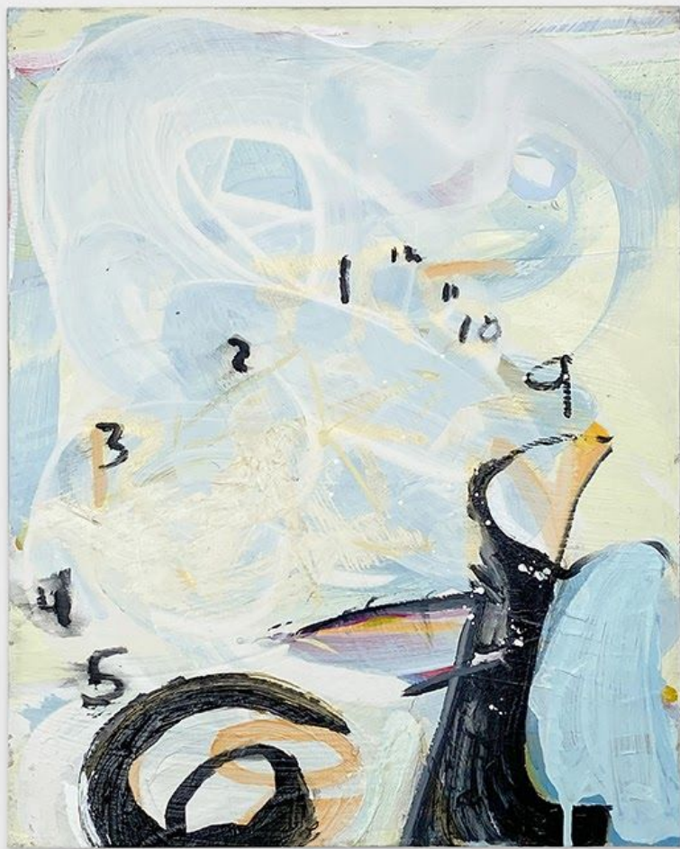
O' Clock AM , 2018-2020, oil on linen, 20 x 16 in. (51 x 41 cm.)