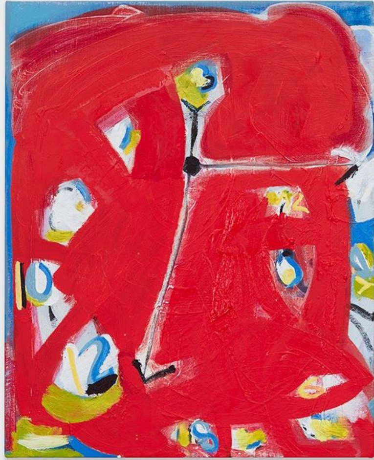
O' Clock in Red , 2018-2020, oil on linen, 20 x 16 in. (51 x 41 cm.)