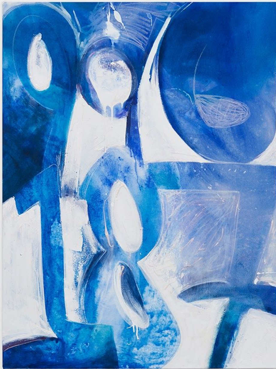
Healing Code for Protection from Character Assassination-Female on Female, 2020, polymer on canvas, 40 x 30 in. (102 x 76 cm.)