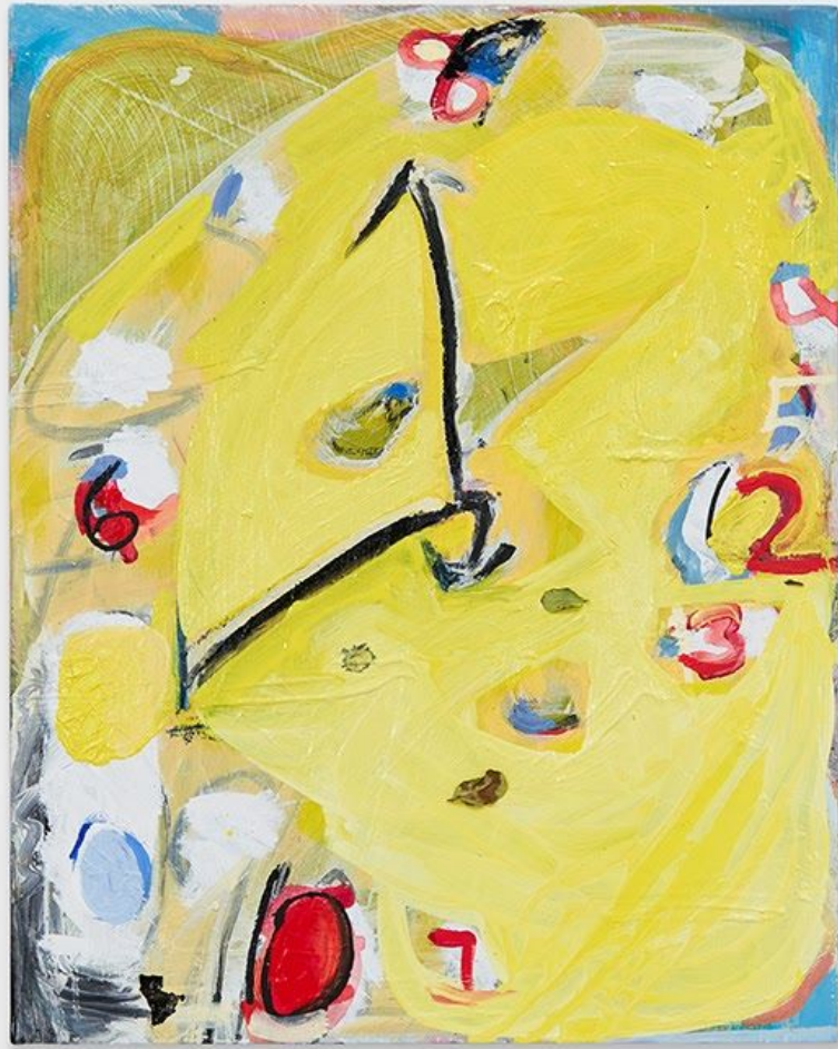
O' Clock in Yellow , 2018-2020, oil on linen, 20 x 16 in. (51 x 41 cm.)