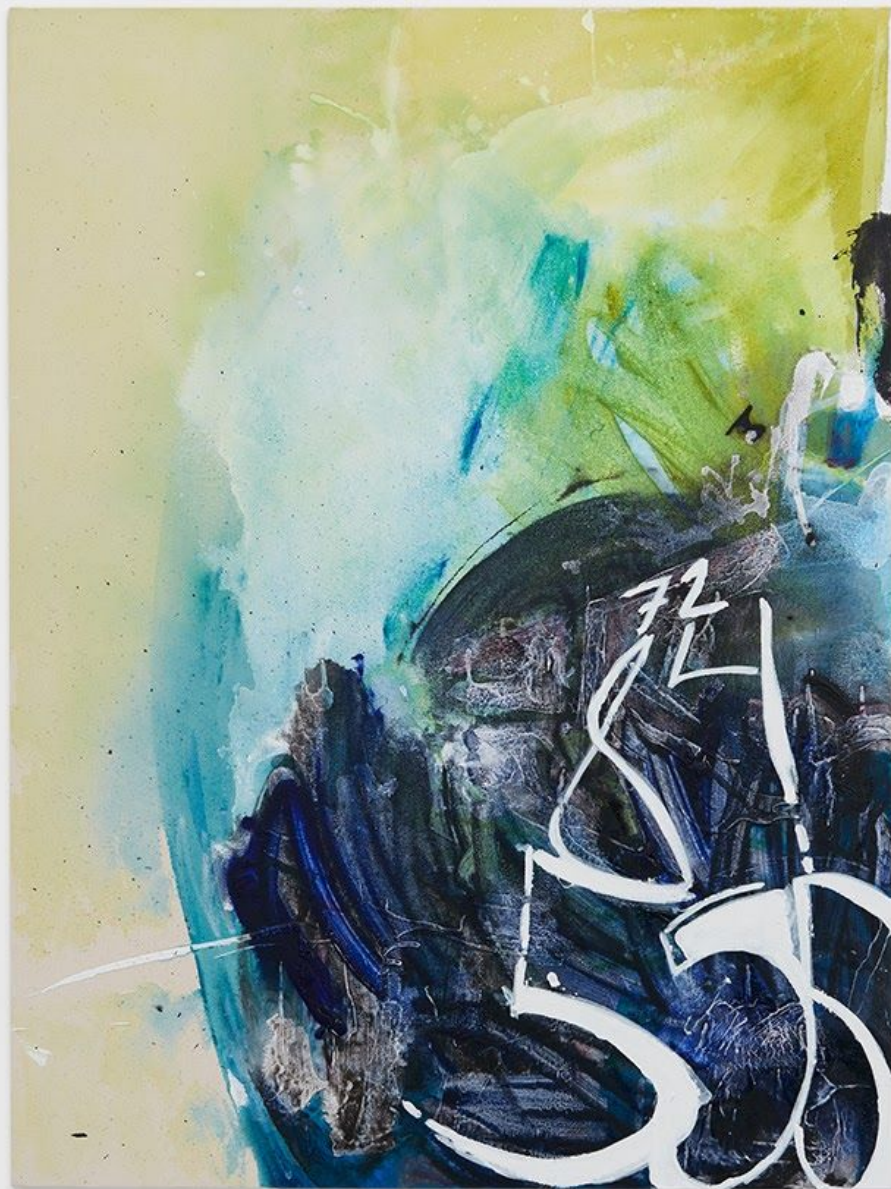
Healing Code for Panic Attacks , 2020, polymer on canvas, 40 x 30 in. (102 x 76 cm.)