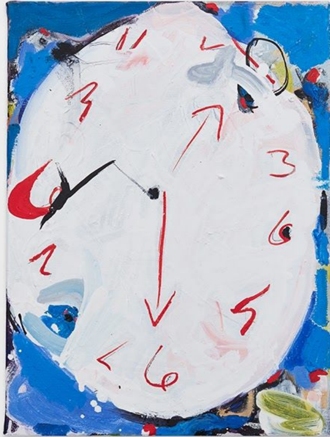
O' Clock 6:00 AM, 2020, oil on linen, 16 x 12 in. (41 x 30 cm.)