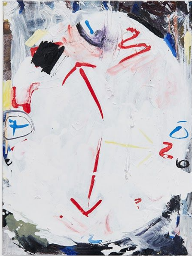
O' Clock 4:00 PM , 2020, oil on linen, 16 x 12 in. (41 x 30 cm.)