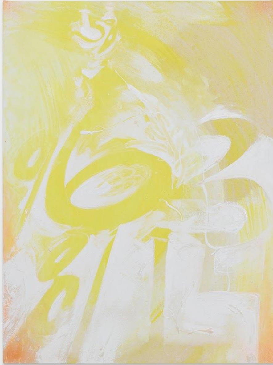
Healing Code to Soothe an Aching Heart, 2020, polymer on canvas, 40 x 30 in. (102 x 76 cm.)