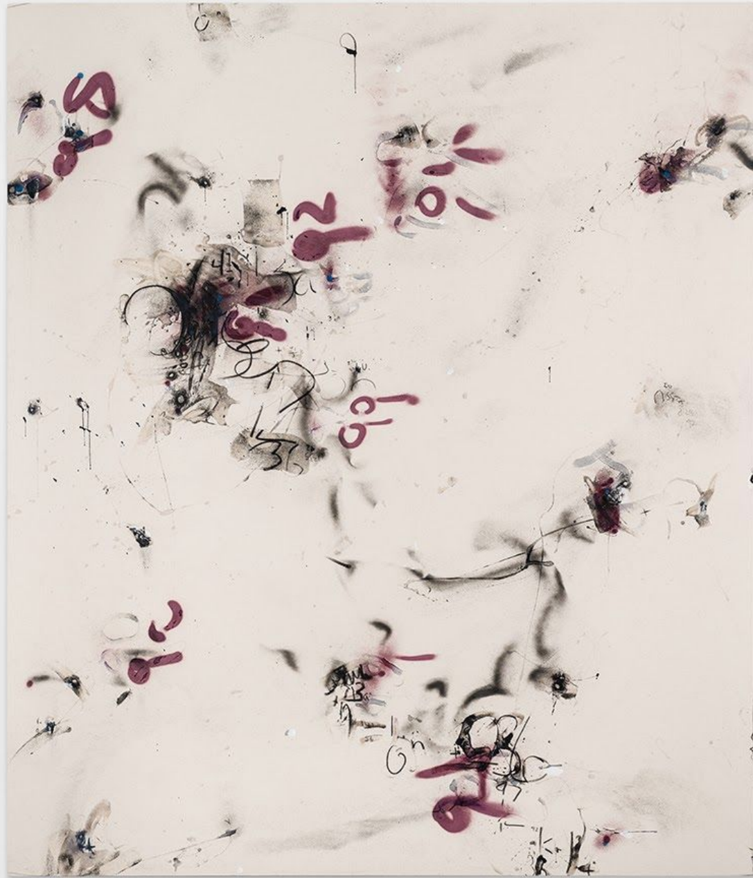
Formula No. 1 with Barium and Krypton, 2019, mixed media on canvas, 85 x 75 in. (216 x 191 cm.)