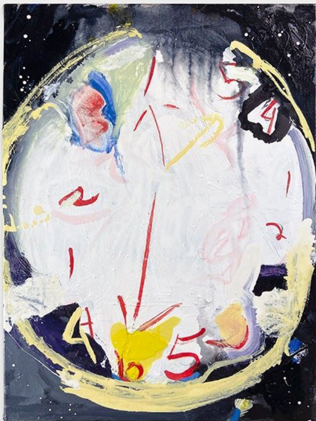
O' Clock 6:00 PM , 2020, oil on linen, 16 x 12 in. (41 x 30 cm.)