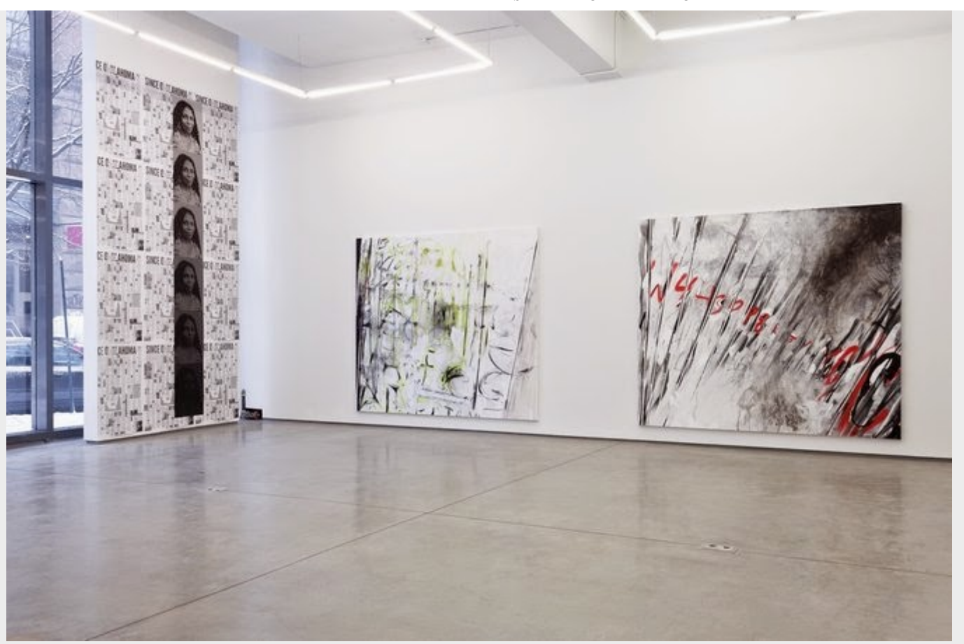
Suzanne McClelland, installation view.

From the snippets of truncated text and obscured imagery to the shades of gray and washy brushwork, the work in McClelland's exhibition aptly conveys in her own visual language the uncertainty of the fugitives' stories. The matter-of-fact authoritativeness of the typeset text and photographic imagery that appears in the timeline poster gives way in the large-scale paintings to less grounded and more intuitive gesture, drawing, and writing. The resulting layered surfaces and shifting, mysterious spaces reflect both McClelland's searching and the inevitable erasure of information that happens over time. Thus, as she examines the news reports, texts, and images that constitute her research materials, McClelland seems to understand less and less, and to become more anguished by the fact that she will never know what happened.