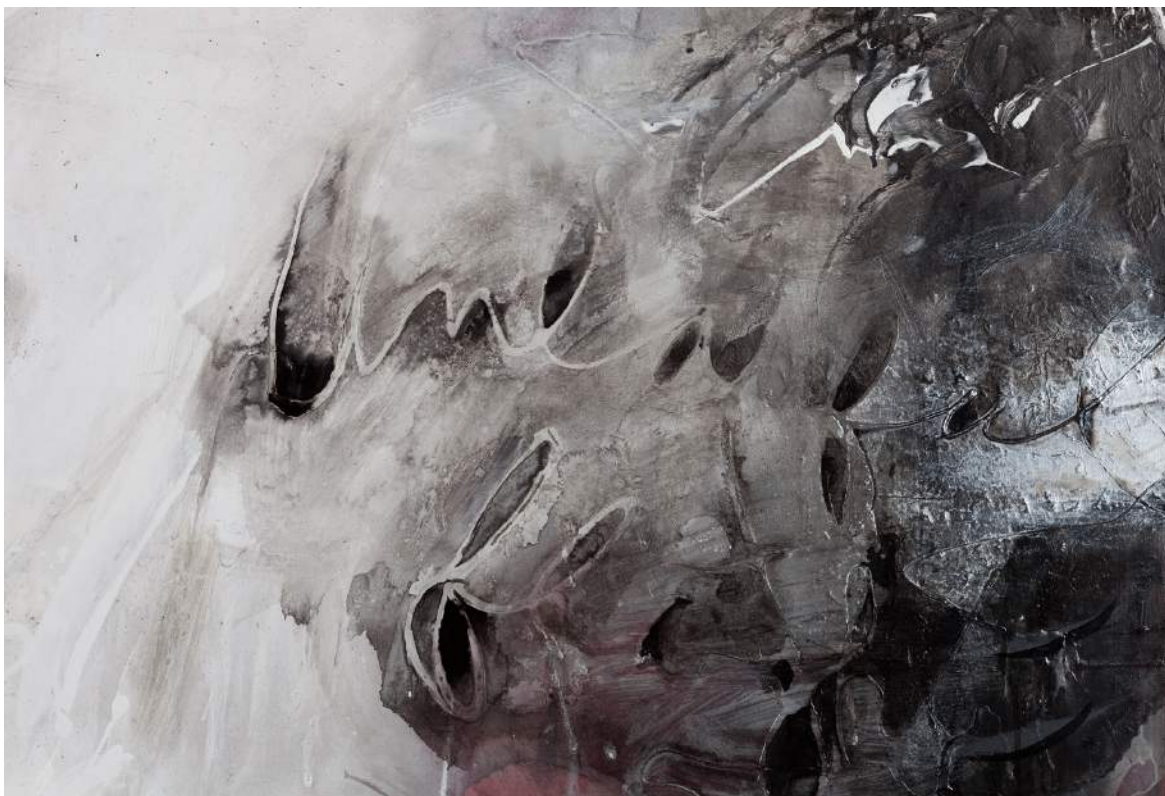
SUZANNE McCLELLAND , Domestic Terrorist - Shakur Reward $2,000,000.00 , 2015 – Details